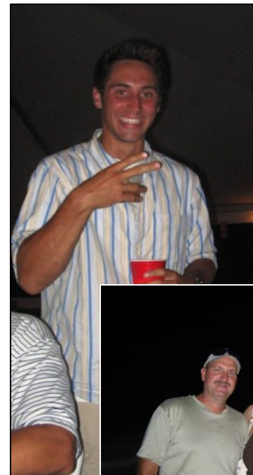
August Pavilion Party Pictures

Live Band, Food and Drinks September 16 th , 2006 at 7:00 PM (Complimentary for Members and Guests) Adults Only! Sponsored by Your GSW Membership Committee